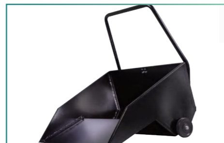
waste bin with split design