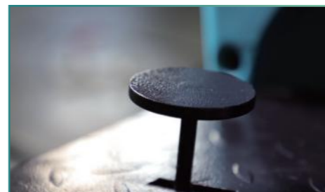
Ergonomically designed duster foot pedal