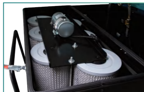
Extra large 6-barrel filtration system