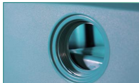
Sealing thread design in solution water tank inlet